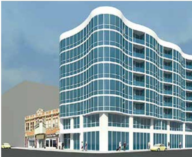
This 80' rental building of modern steel, glass and exposed concrete with 97 units and 58 parking spaces conforms to the current height limitation for this property.

Chicago Development Partners LLC have met with various neighborhood groups and hosted a public meeting re: their plans for the development of the southwest corner of North Avenue and Clark Street. They requested that the NDA share renderings of their two proposed options with NDA members. The design options below were recently sent electronically to NDA members