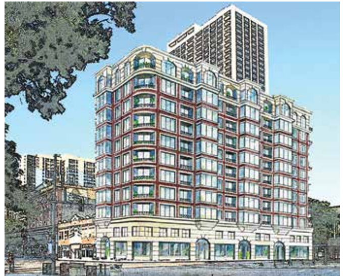
The 125' classic brick and limestone design (a portion of the three story height is purportedly used to offset the cost of more expensive materials) will either contain 122 rental units with 54 parking spaces or 62 condominium units with 79 parking spaces. This building would require a zoning change for the increased height.