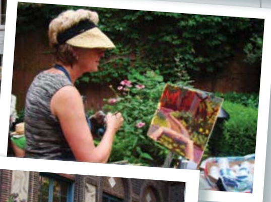
Photos from the 2013 Dearborn Garden Walk